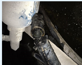
Melted hydraulic line

At the mine a hydraulic power pack used for a belt take up underground overheated, due to an electronic solenoid that was stuck open, causing the hydraulic pump, valving controls and hydraulic fluid to overheat. As a result the hydraulic line melted and sprayed hydraulic fluid everywhere. Because the mine was using QUINTOLUBRIC® 888-68 fire-resistant hydraulic fluid a fire did not erupt.